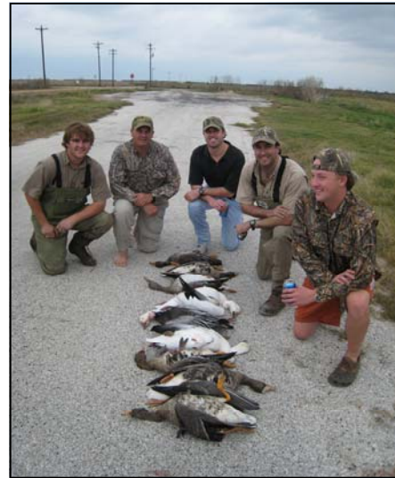
Speck hunt with Multi-Lease on Chesterville