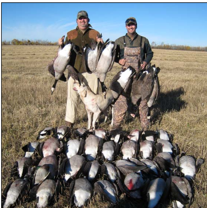
Find the Big Boys in Saskatchewan

Speaking of 2008-2009: If you have a suggestion or a nominee for a lease spot, let us know. Nominees will be slotted into a lease if we have an opening and if we think someone is a good fit for a particular lease. As for existing members, plan on a little more structure to the lease payments and paperwork this year. Deposits for all continuing lease programs will be due on May 15 th with the balance due on August 1 st .