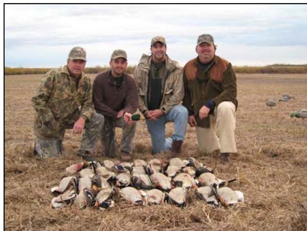
YbHC in Saskatchewan