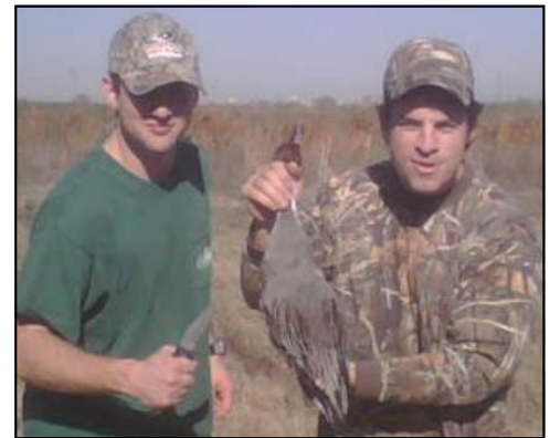
Not sure what's going on here