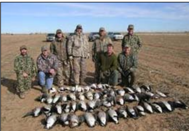
YbHC in the Texas Panhandle

II. Panhandle: January 3-7 we plan to hunt with Blackfoot Outfitters in Lubbock, Texas. Center stage here is the Canada geese, Snows and Specks that winter in and around Lubbock. Ducks, Sandhill Cranes and, depending on the season dates, Pheasants may work their way into the mix on this trip. We have not done this trip in a few years but it was a good one for us for about 5 years in a row. We tried some other areas and think that in the North Texas/Panhandle area, Blackfoot is the top outfitter. Pricing is still being determined but deposit checks will be written in late April. More info: www.blackfootguideservice.com