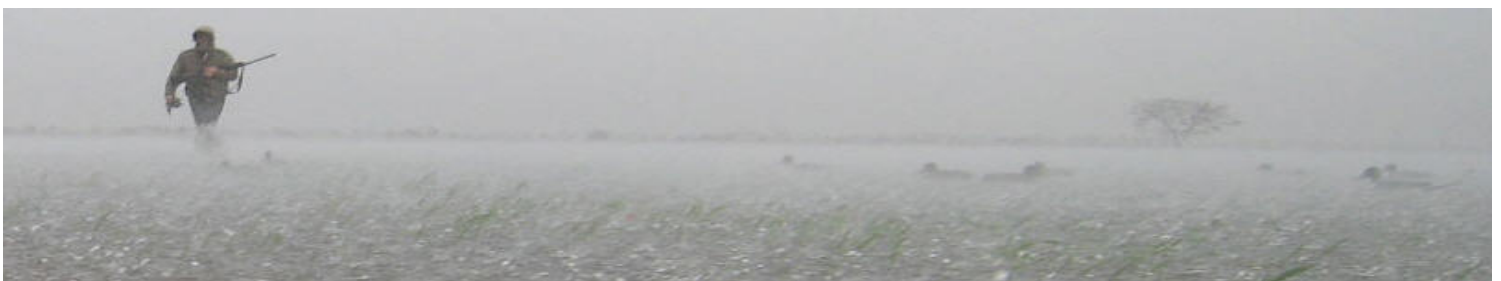
J.J. at North Brookshire in a downpour