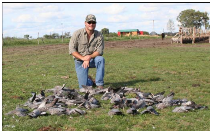
YbHC in Argentina