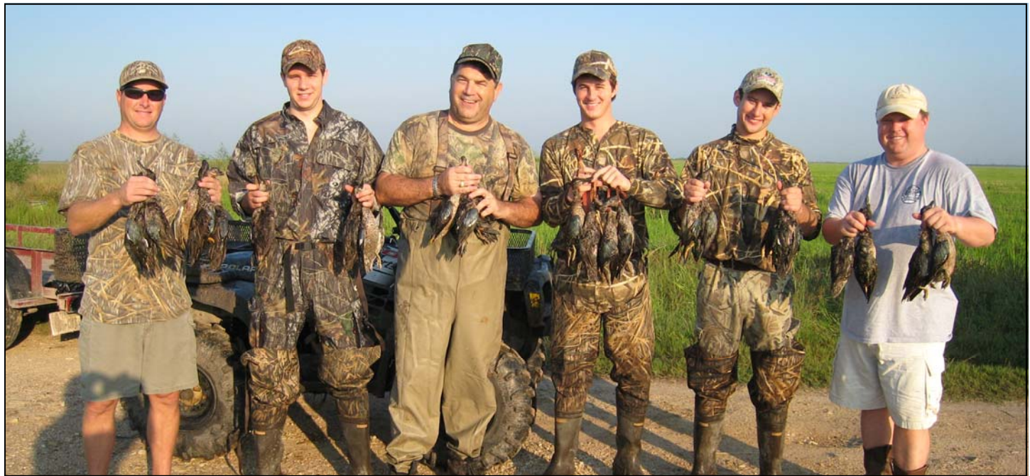
Multi Lease Teal hunt