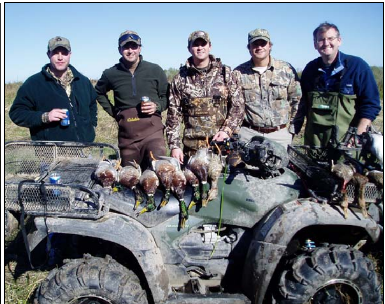
We sure do like the ATV pics